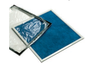
Contact 'Skin' and Air Filter